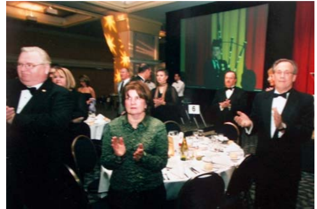
Members and guests applaud as the 2005 UFE graduates are piped into Convocation.

And with those words, our new graduates certainly have many mentors from which to draw inspiration and guidance, including our new FCAs and our latest CA of the Year. With members in industry, public practice, education and government, the profession boasts a diverse range of role models and Convocation is an important occasion for recognizing and celebrating this diversity. Maybe it's the glamorous dress, the music or great company, but Convocation sure knows how to package the profession and for one night, remind us of our proud heritage and promising future. From all of us at ICANS, congratulations!