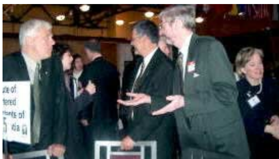
Auditor General Roy Salmon, FCA and the Minister sharing some thoughts on government finances

Prior to the Minister's presentation, The Chamber unveiled its new scorecard system on government performance, and assigned the Minister of Finance's government only a "Fair" rating, based largely on the Chamber's assessment of the government's slow progress in reducing the debt. "Simply put, Debtwatch is a compilation of data from five key indicators of financial health: Tax Competitiveness, Flexibility, Vulnerability, Managing within budget and Sustainability," says Chamber Board Chair, Jeff Somerville.