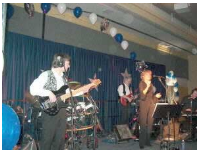
Blue Bay keeps things rockin' at the Convocation

Despite a date change necessary to accommodate the ECMA awards, the Institute event was almost a victim of its own success, as the capacity of the room becomes an issue as registrations increase — this is of course a good thing, and Council is delighted for the members' interest.