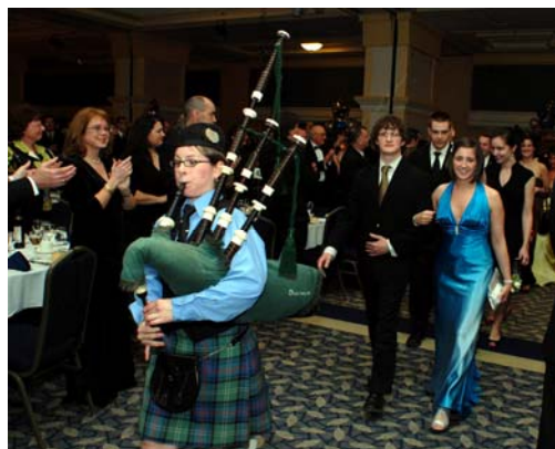
Piping in the UFE graduates, FCAs and honored guests of ICANS' 2008 CA Convocation.